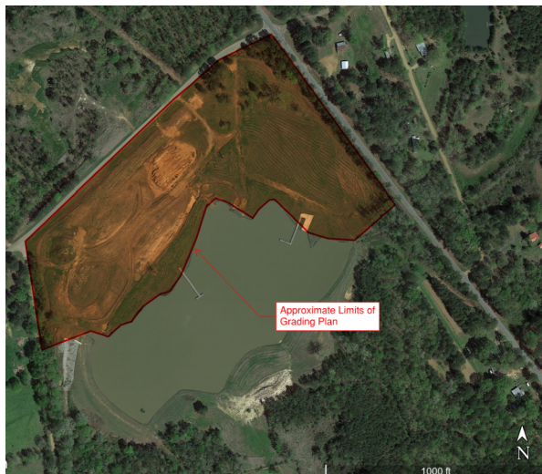
Figure 1. Sulphur Springs Park Existing Conditions

The site near Camden, Mississippi, at the intersection of Sulphur Springs Road and County Road 17, was graded by County Forces in an effort to better stabilize the site and improve stormwater drainage conditions as part of the Stormwater Pollution Prevention Plan (SWPPP) Project Thompson Engineering assisted with in 2018 (See Figure 1, below). Since completion of grading and stabilization of the site, Madison County has engaged the planning firm of The Haygood Group, LLC to develop a park master plan (See Figure 2, below).